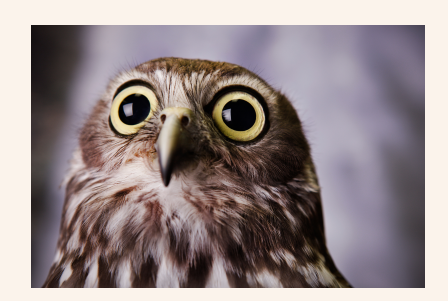
to the great outdoors!